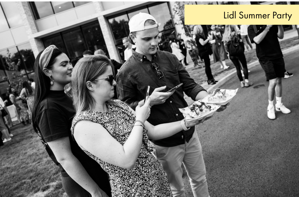
Lidl Summer Party