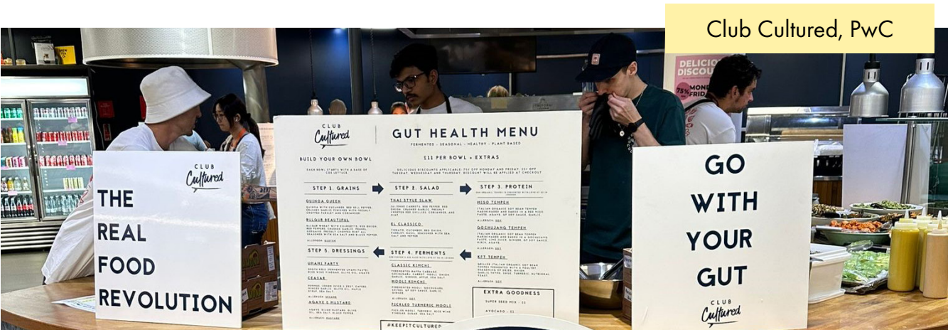
Club Cultured, PwC