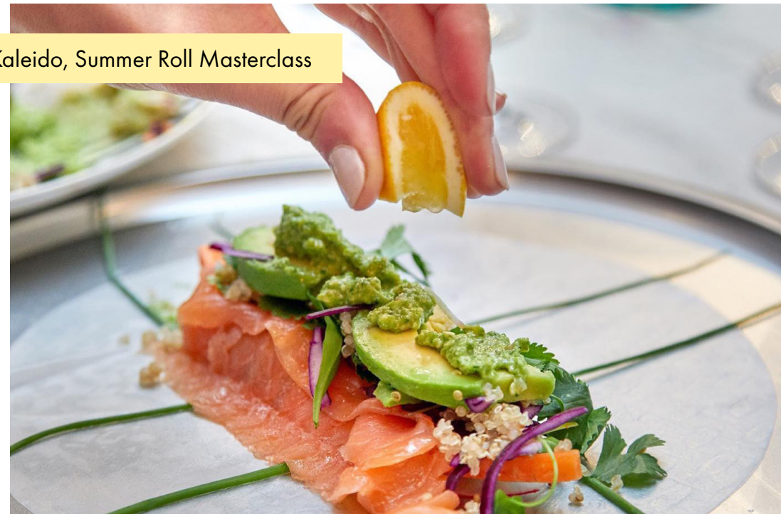
Kaleido, Summer Roll Masterclass