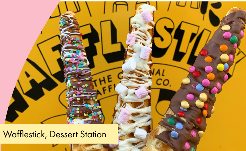
Wafflestick, Dessert Station

Our clients love to add a little extra to their employees' days! If an experience is something you can offer, whether it be a cooking masterclass, wine tasting or even something a little more obscure, please let us know. We can promote your idea through direct marketing and share directly with our clients who love to do things a bit differently.